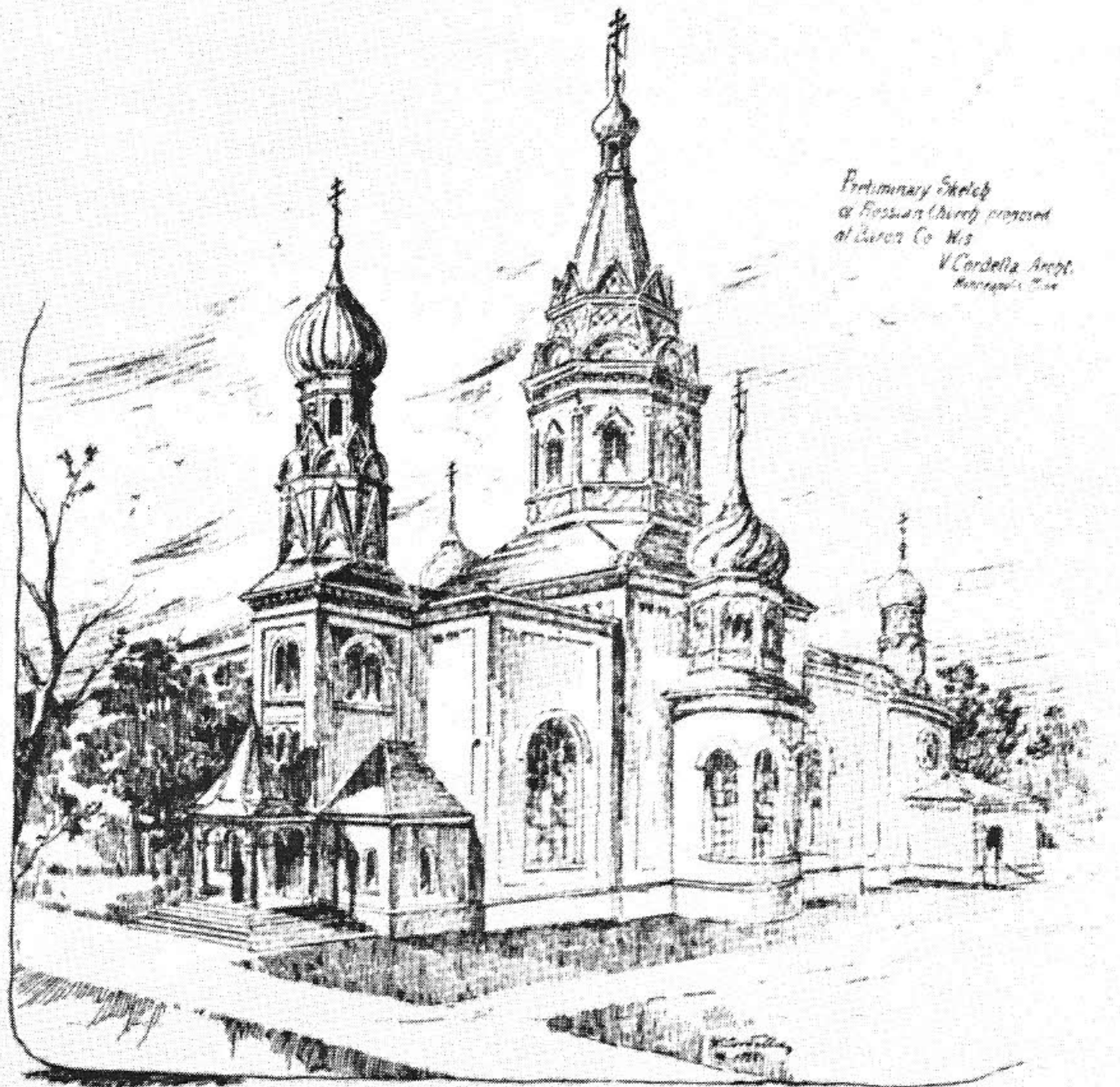
Preliminary Sketch of Russian Church proposed at Luzon Co Wis V. Cordella Archt. Milwaukee Wis